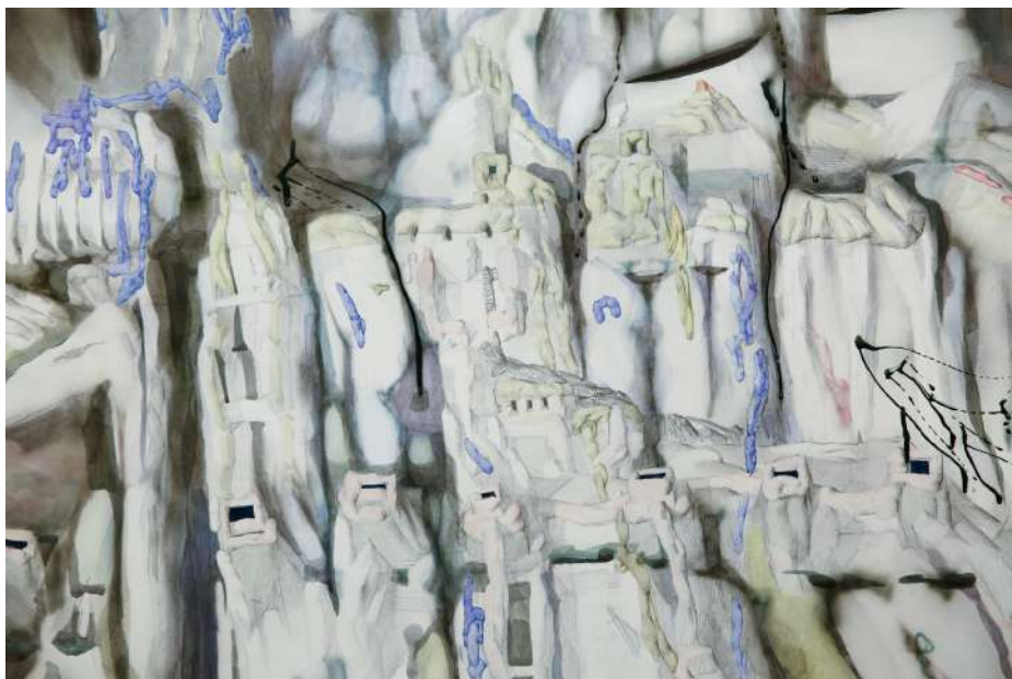
Hà Ninh Pham, B2 [Square Hamlet - detail], 2024, graphite, acrylic, ink, and colored pencils on paper 140 x 280 cm