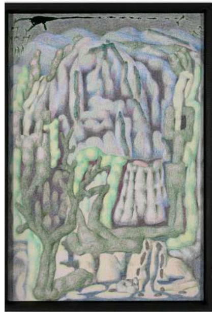
Hà Ninh Pham, A2.4,5 [Hermetic property no.4,5], 2024, colored pencils on paper mounted on PVC board 16.3 x 11 x 2.5 cm

PLEASE CLICK THIS LINK TO DOWNLOAD HD IMAGES WITH CAPTIONS https://drive.google.com/drive/u/2/folders/1zyz_ae04ggNiwabuLJ28cA-JrEX_R_w