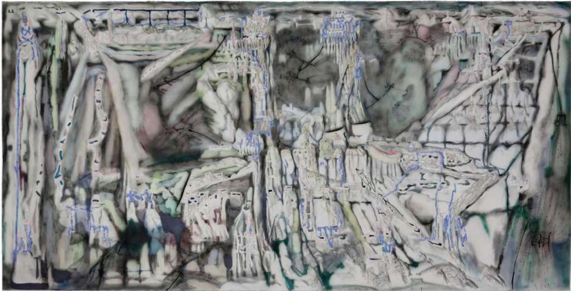
Hà Ninh Pham, B2 [Square Hamlet], 2024, graphite, acrylic, ink, and colored pencils on paper 140 x 280 cm