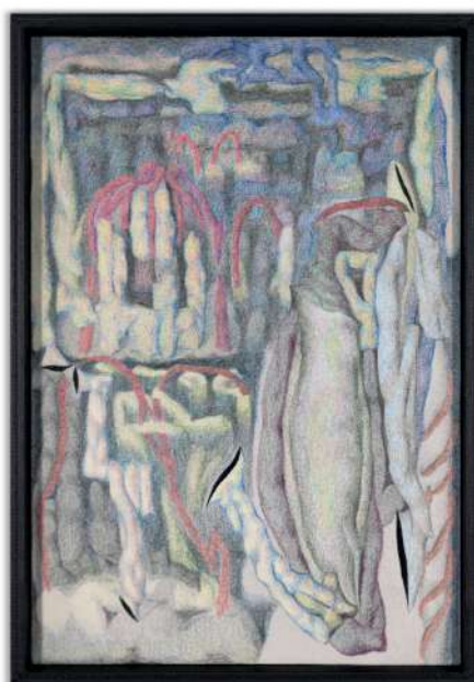
Hà Ninh Pham, A2.1,3 [Hermetic property no.1,3], 2024, colored pencils on paper mounted on PVC board 16.3 x 11 x 2.5 cm