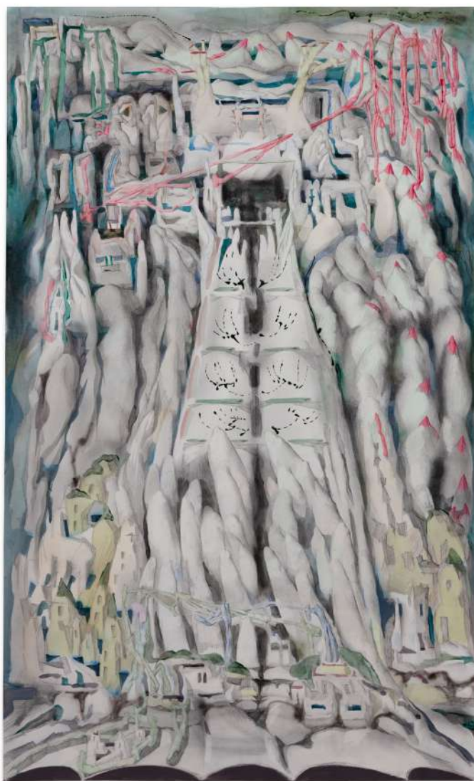
Hà Ninh Pham, D4.1 [Vertical Pump Station],, 2024, graphite, acrylic, ink, and colored pencils on paper 104 x 66 cm